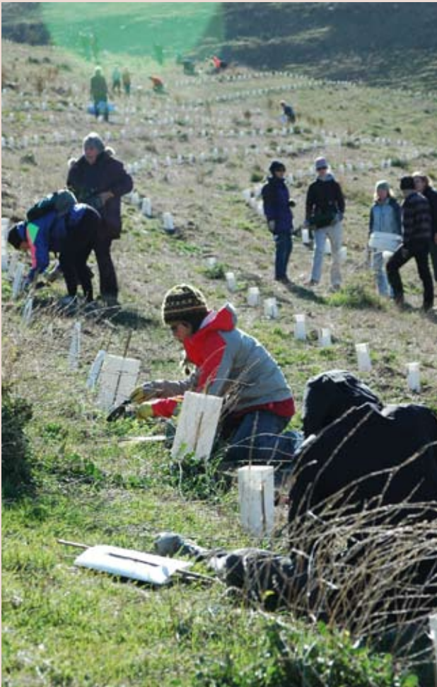
Above: On Sunday 19 July, volunteers led by experienced team leaders quickly formed effective teams.