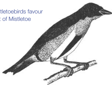
Mistletoebirds favour fruit of Mistletoe

Four trackside signs for Long Forest Nature Conservation Reserve are being produced with the support of a Parks Victoria grant. The theme for the signs is ' Communities of Long Forest '. Some of the ideas for the signs include: